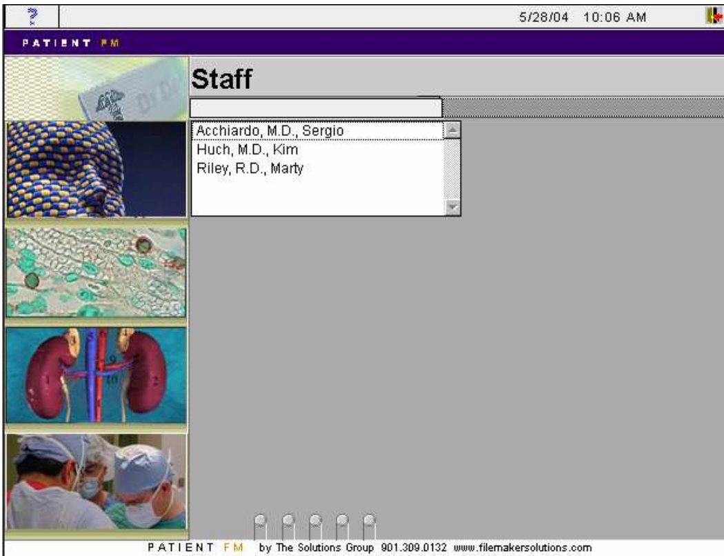
Logon Screen – Enter your Name and Password